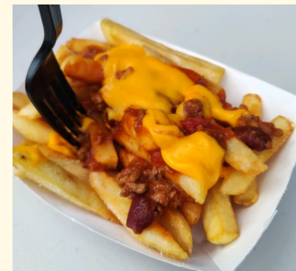
Best cheese fries You'll have to wait till next year!